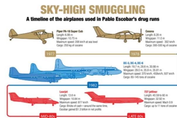
Figure 1 shows how as Escobar's drug empire progressed his methods progressed as well

Although an ingenious smuggling idea of Escobar's was the use of submarines which were manufactured out of super light materials like wood and fibreglass for example. This coupled with the fact that when the submarines were being deployed, they also were not entirely submerged to avoid detection. All his innovative ideas for smuggling coupled with his charming personality made him an unbeatable enemy for Colombia. Escobar managed to create a 'robin hood' character of himself in the eyes of the people. Escobar used his extensive wealth, which at the height of it he was bringing in 50 million dollars daily and had a net worth 30 billion. This afforded him to build schools, churches, football fields all which made him seem so magnanimous, which gained him unchartered popular support. Another factor which made Escobar a genius drug lord was that he always appeared as an incredibly meek, calm and docile person on camera when he was being interviewed by the press. But his reputation preceded him which was that of a brutal drug lord that killed over 4,000 people. Escobar's Treachery truly knew no bounds. Nevertheless, his contrasting personality on screen to what the media reported about him which was that he killed all who defied him regardless of age or gender, made for an unstoppable public enemy.